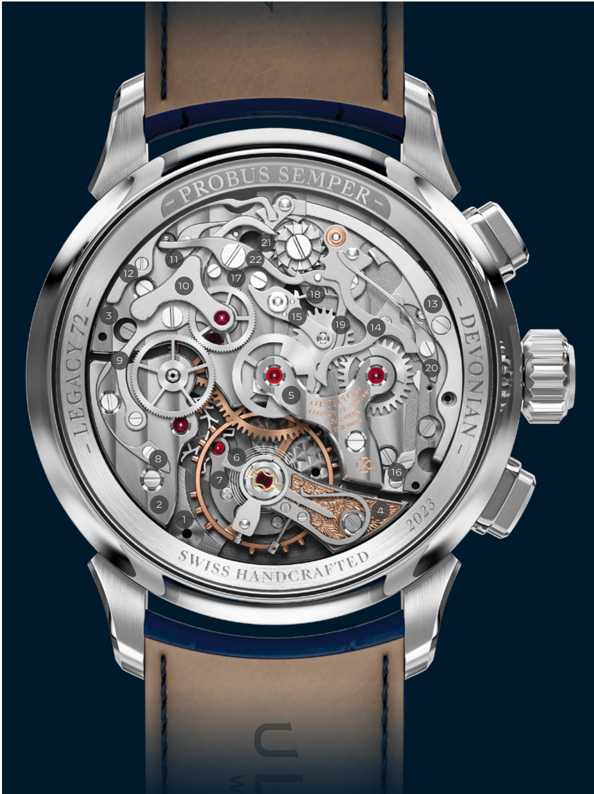
Pristine and authentic new original stock (NOS) Valjoux 72